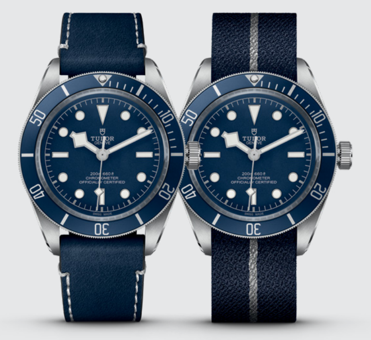
Swiss price (VAT incl.) CHF 3'200.-