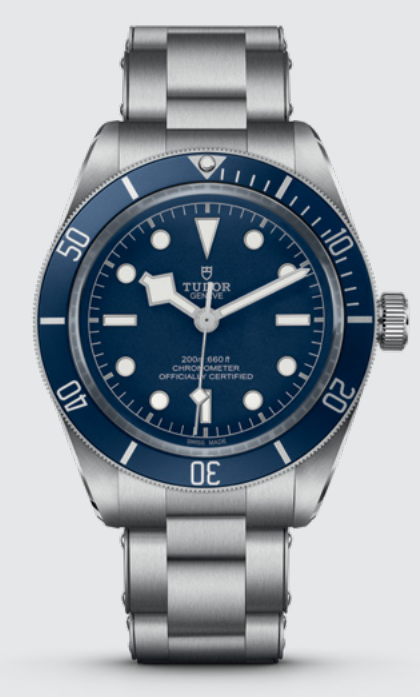
Swiss price (VAT incl.) CHF 3'500.-